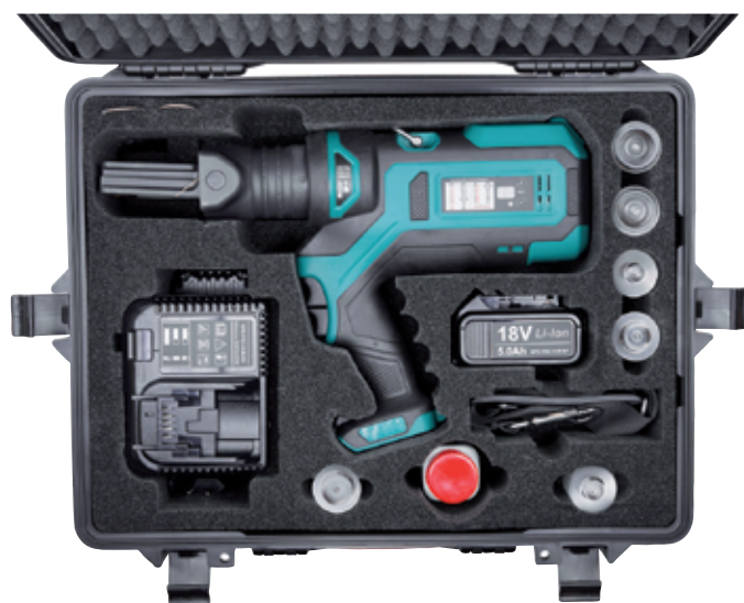
The lightweight and ergonomically designed assembly machine is located in the sturdy trolley along with all components. A spare battery and charger are included in the set.