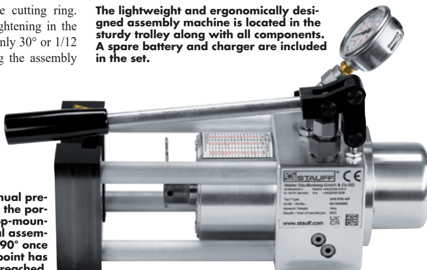
Following manual pre-assembly with the portable table top-mounted unit, final assembly is only 90° once the pressure point has been reached.